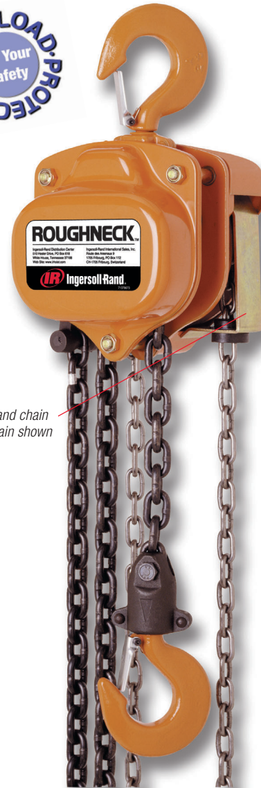
Nylon bushed VL2 hoist hand chain guide. Zinc plated hand chain shown